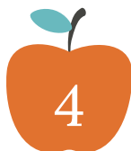
Grant Writing Workshops